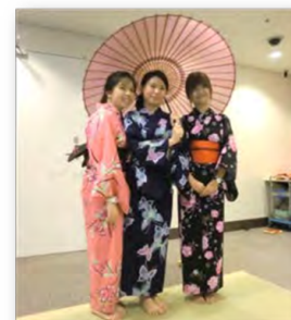
Kimono Trial and more - - -